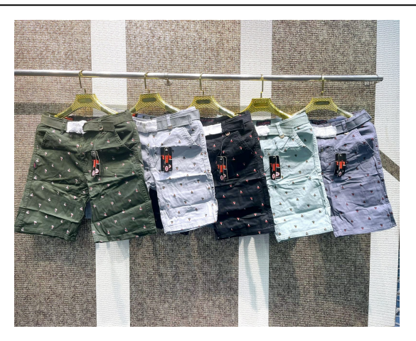
MEEM WEAR PRINT STRECH HALF PANT

Price: <sup>₹510</sup> Original price was: ₹510.<u>₹255</u>Current price is: ₹255.PCS